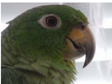
Spike a Mealy Amazon Parrot