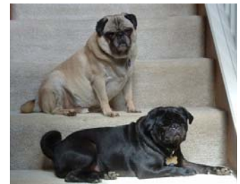
Pugs, Dylan and Nicky