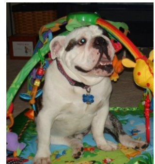
This is Toby the bulldog.