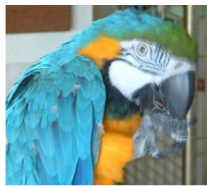
The Blue and Gold Macaw Cody